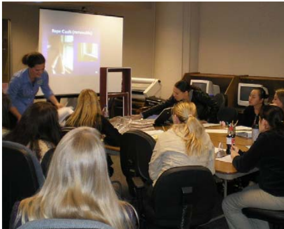
Community Weatherization Workshop

CEP successfully provides interactive energy education for nearly 1,000 families annually. Now we can offer you tips and lessons learned from 30 years of success!