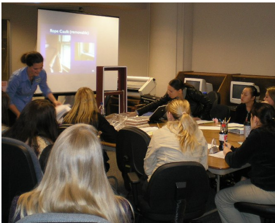
Community Weatherization Workshop

CEP successfully provides interactive energy education for nearly 1,000 families annually. Now we can offer you tips and lessons learned from 30 years of success!